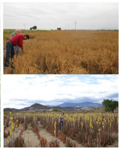
Fig. 1 Top left quinoa (Chenopodium quinoa) field north of the Salar de Uyuni, Dept. Potosi, Bolivia; below left field of nopales (Opuntia ficus-indica), State of México, Mexico; center home garden in central Uganda with plantains (Musa paradisiaca) and

common bean ( Phaseolus vulgaris ); top right, safflower ( Carthamus tinctorius ) field, NE Salta, Argentina; below right true aloe ( Aloe vera ), field Dept. Zacapa, Guatemala.